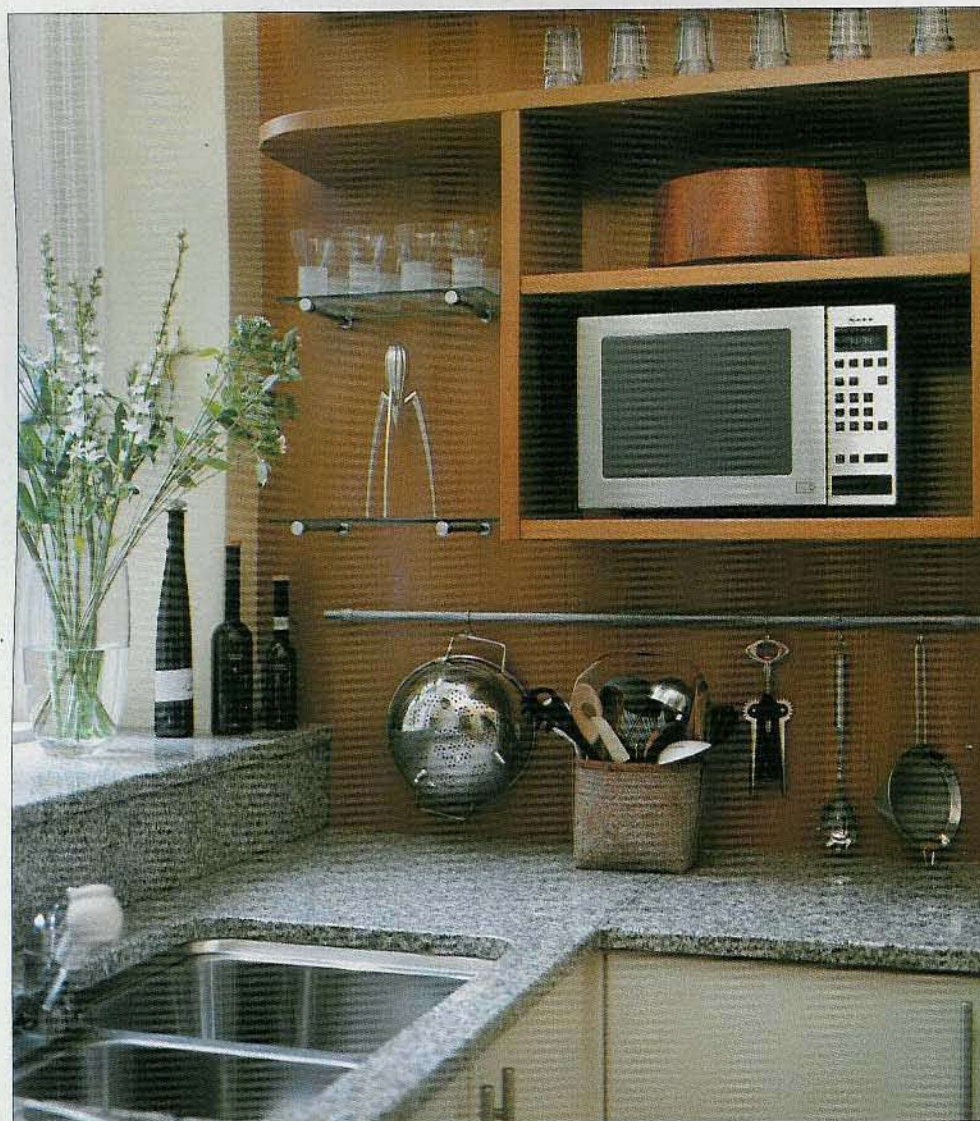
Granite has been used for the window sill, transforming it into an extra work surface

storing laundry appliances, Lee has managed to come up with a solution that allows her to keep the kitchen looking neat and sophisticated when she's entertaining, but by swinging out the cabinet doors, Lee can transform the room into a laundry on wash day.