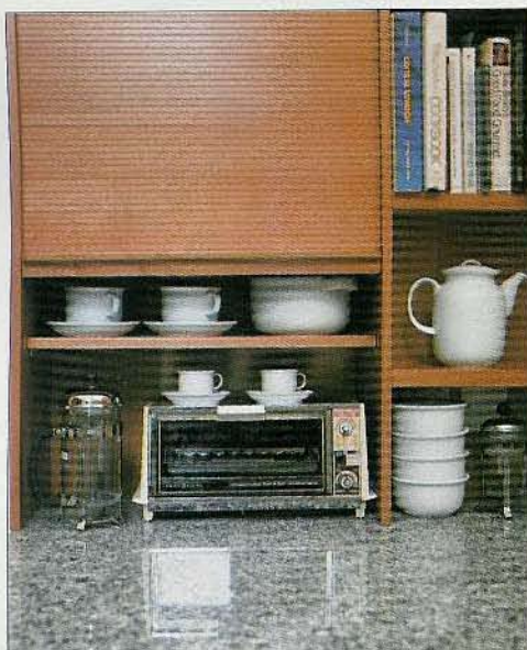
A tambour shutter fixed to the front of this shelving unit can be pulled down to keep the kitchen tidy