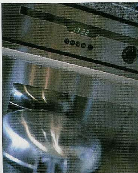
Stainless steel appliances give the kitchen a sharp metropolitan edge