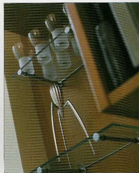
Open glass shelving looks lighter than heavy wall cabinets and can be used to display glassware